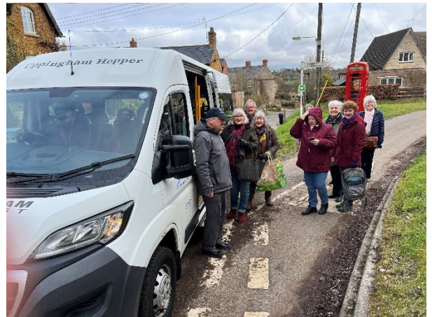
Hopper service to Bisbrooke