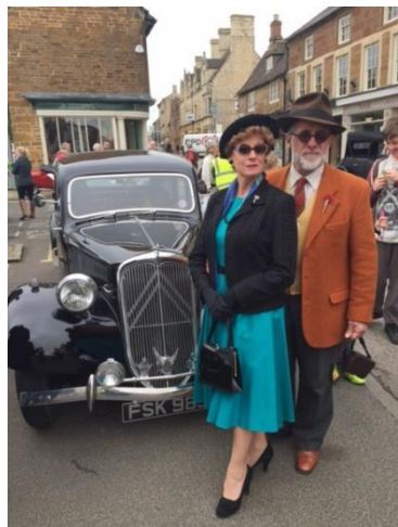
The Stilton Cheese Run

The further development of the partnership's website at www.uppinghamfirst.co.uk sponsored by local company ClockedIn