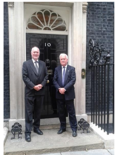
VB Representatives at No 10

The board's main task during the past year has been to support dialogue with those involved in, or impacted by, the updating of the Uppingham Neighbourhood Plan. The board's next meeting will be looking at the town's infrastructure needs in the light of its updated Neighbourhood Plan and the additional housing it proposes. Highways, Transport, Education and Health will feature. The meeting will follow the publication this autumn of the new draft Rutland Local Plan being prepared by Rutland County Council.