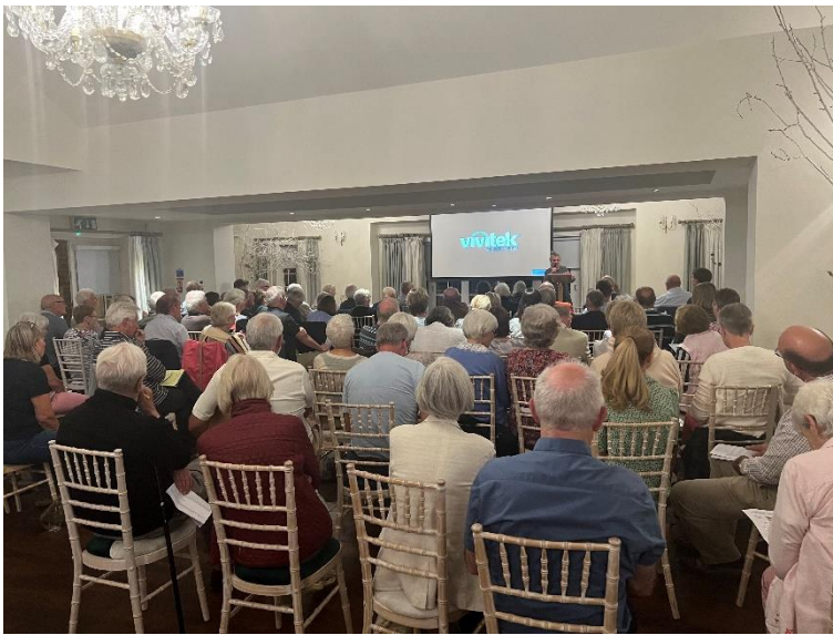
Uppingham Neighbourhood Forum being addressed by the County Council