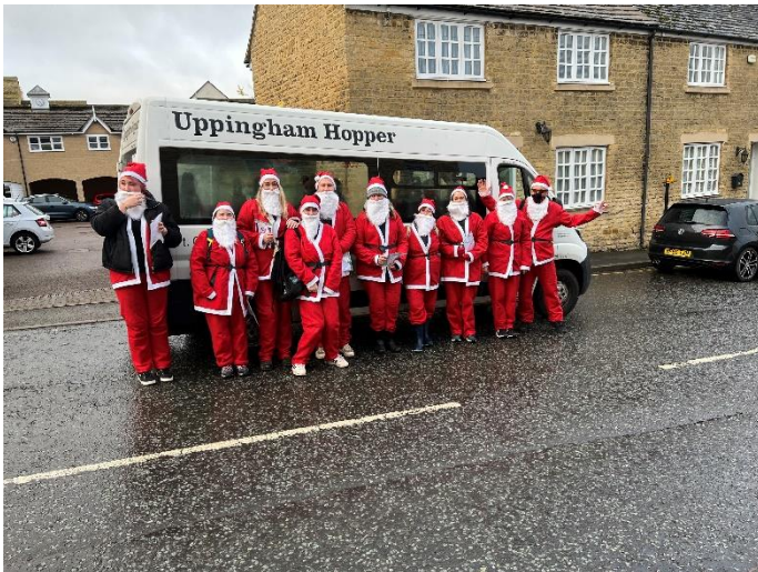
Uppingham Hopper supporting local charities