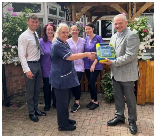
Defibrillator donation to Care Home

Acting as a community partner for the Gigaclear Uppingham Fibre Broadband Network